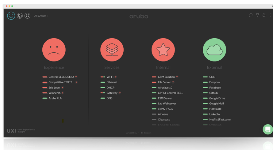
Figure 2. HPE Aruba Networking User Experience Insight: administrator dashboard

This helps administrators quickly see the health of the overall experience, network services, and internal and cloud-based applications. Clicking on any element displays more details while the troubleshooting triage tool and the ability to look back in time make troubleshooting faster.